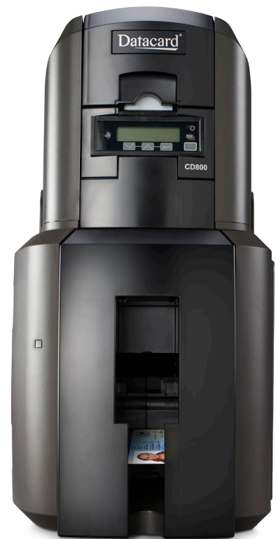
Datacard® CD800™ Card Printer with inline lamination module