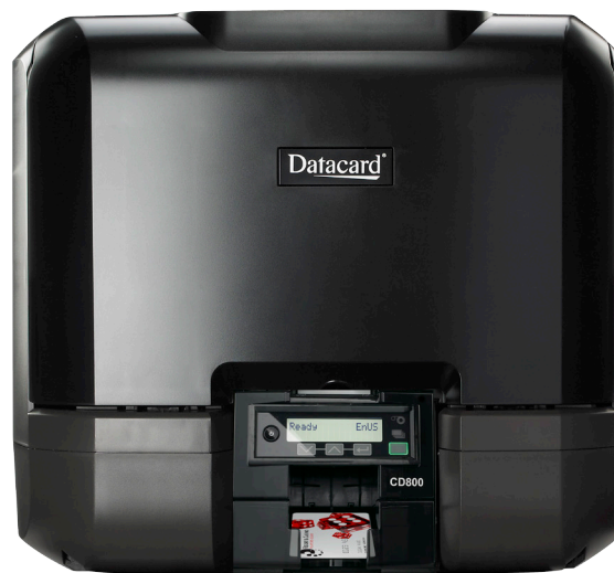
Datacard® CD800™ Card Printer with optional multi-hopper